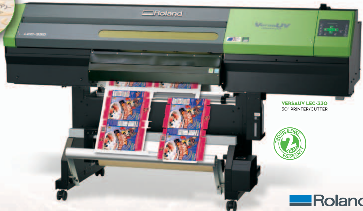
VERSAUV LEC-330 30" PRINTER/CUTTER