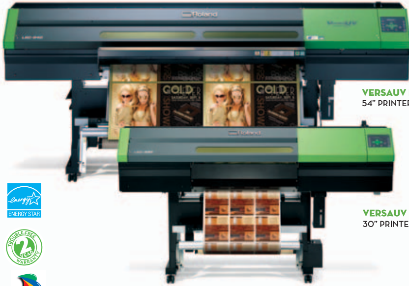
VERSAUV LEC-540 54" PRINTER/CUTTER